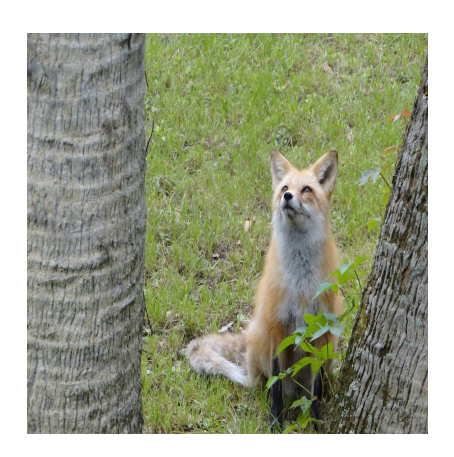
All I Really Need to Know